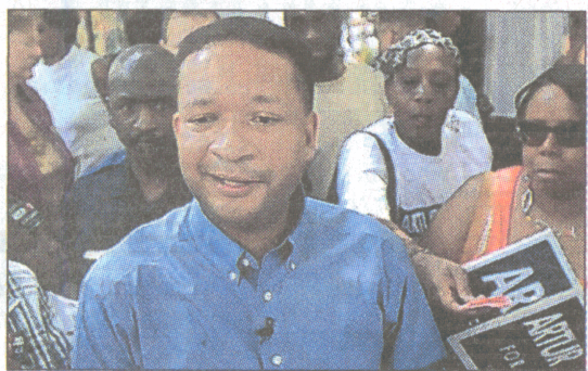
In his run for governor, Artur Davis didn't seek the endorsements of Alabama's major black political groups.

Strategy will have ramifications beyond this election